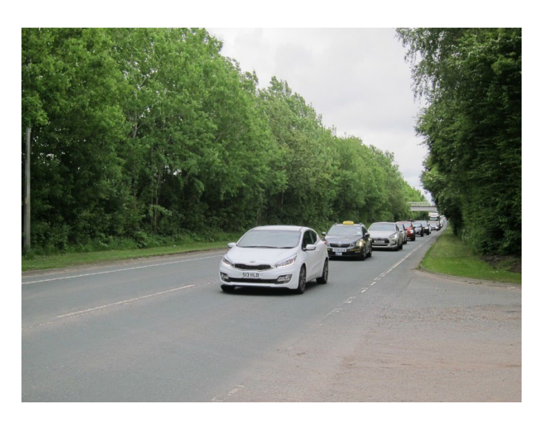
Photo 13: PM, Brook Lane (G S U Landscapes), looking South down A582 Penwortham Way towards Tank Roundabout.