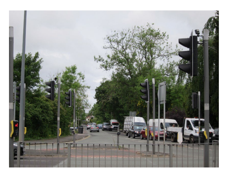
Photo 9: PM, A582/Chain House Lane junction view of traffic egressing on to A582 Penwortham Way.