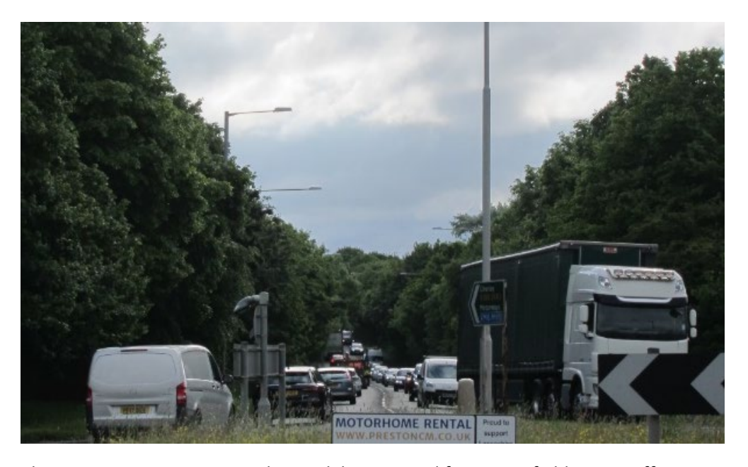
Photo 16: PM, Croston Round Roundabout to and from Stanifield Lane traffic queuing in both directions.