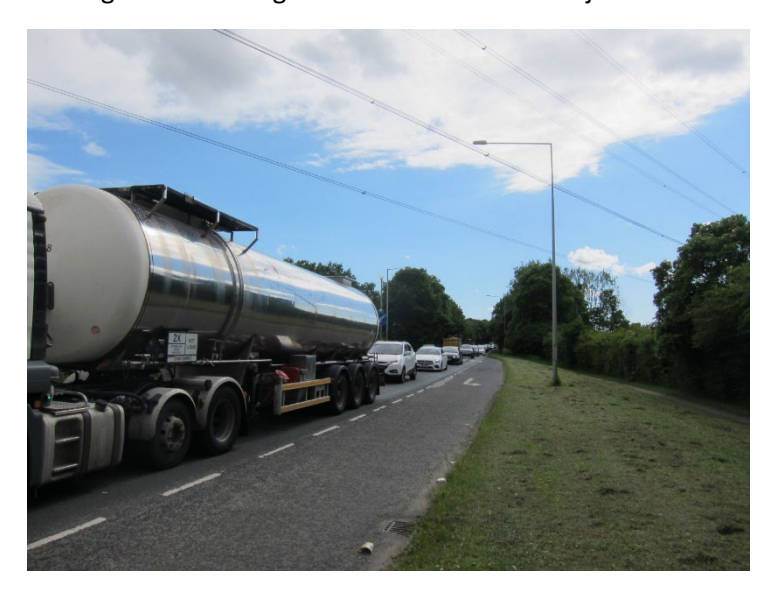
Photo 5: PM, queue to Stanifield Lane Roundabout extending back beyond the Industrial Estate off Sherdley Road. This queue goes back over the WCML rail bridge to the A582/Croston Double Roundabout.