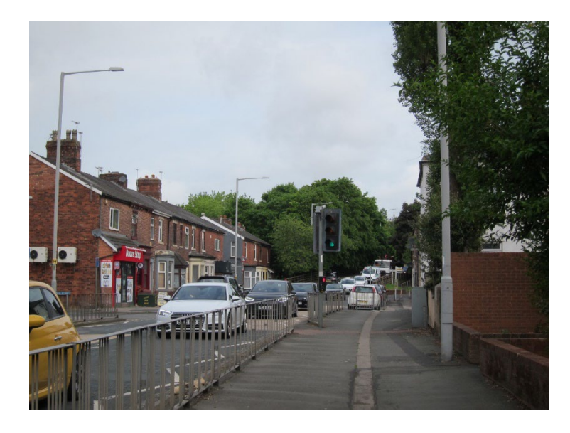
Photo 8: AM, Looking North up Watkin Lane (B5254 – becomes Leyland Road further North) adjacent to Ward St. Queue extends over the railway towards Tardy Gate – Coote Lane/Brownedge Road staggered junction.