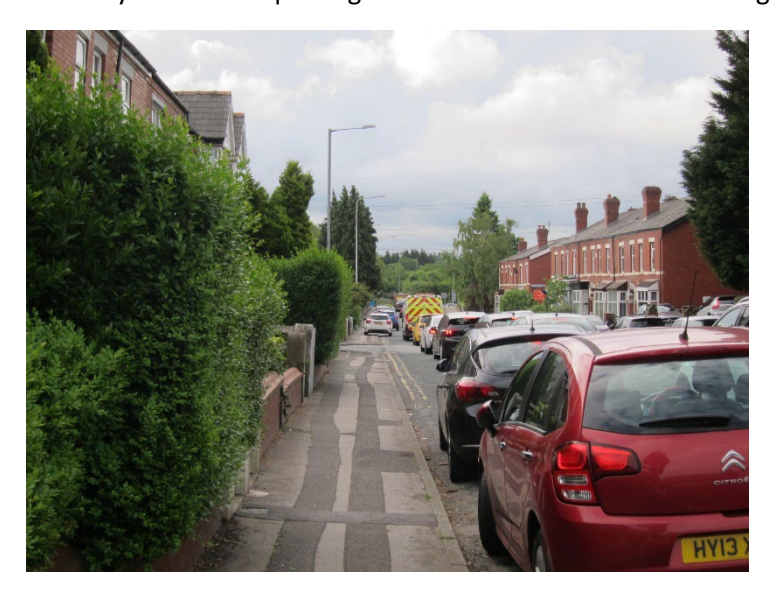
Photo 7: AM, Looking South down Watkin Lane (B5254 – becomes Leyland Road further North) to the A582 Stanifield Lane Junction.

Photo 6: PM, Queue to Stanifield Lane Roundabout as above looking Eastbound from the Industrial Estate off Sherdley Road. This queue goes back over the WCML rail bridge to the A582/Croston Double Roundabout.