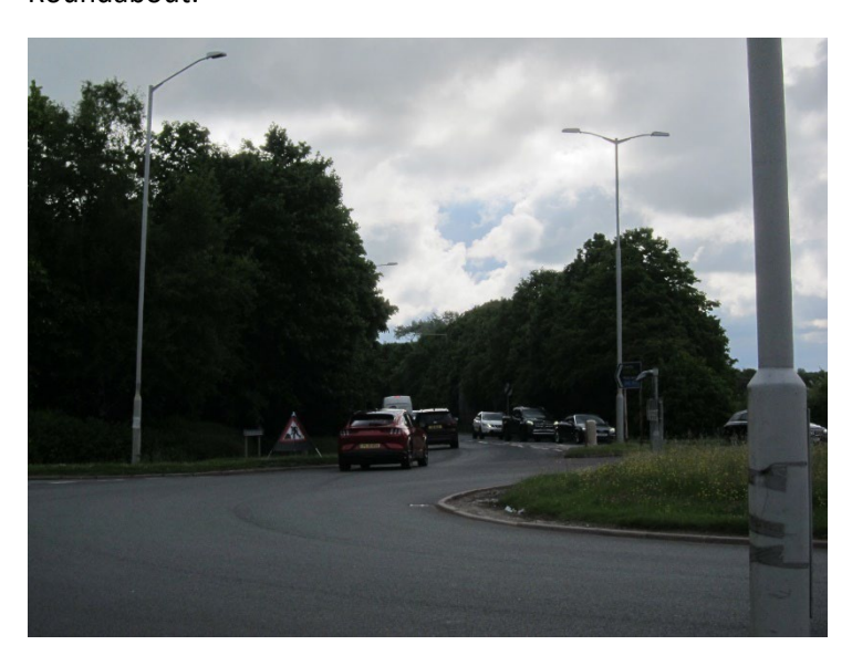
Photo 14: PM, Croston Round Roundabout queue extending back from Stanifield Lane/A582 junction for the full length.