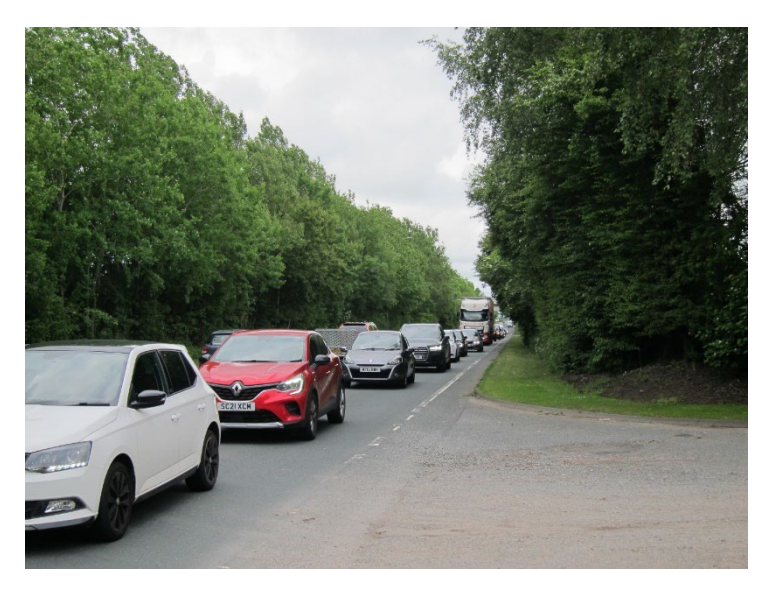
Photo 11: PM, A582 queuing traffic back from Chain House Lane extending back to the Tank Roundabout (Photograph taken looking South).