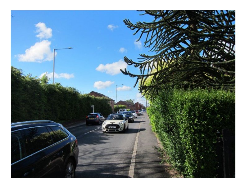
Photo 1: PM, Looking North from Bee Lane Roundabout. Queuing Southbound towards Bee Lane/The Cawsey.

All of the following photographs were taken 24/05/22 where traffic remains influenced by Covid19.