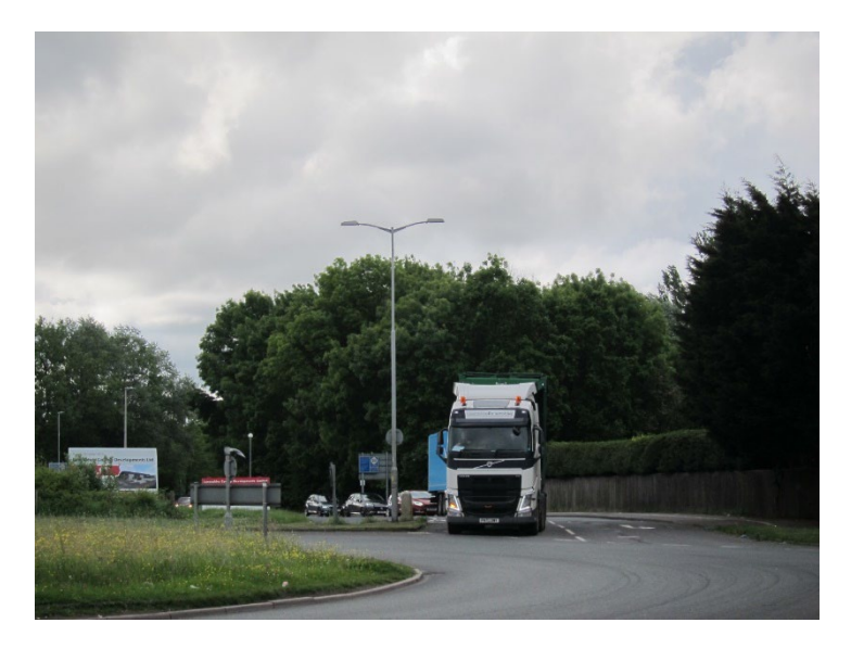
Photo 15: PM, Croston Round Roundabout traffic emerging from Lancashire Business Park (Centurion Way)