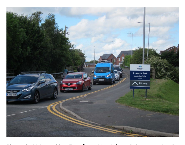
Photo 3: PM, Looking East from Handshaw Drive, queuing beyond the junction with The Cawsey.