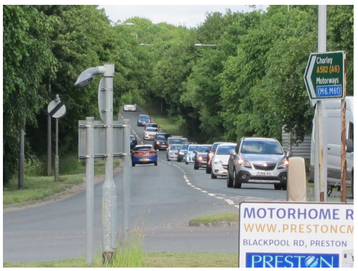
Photo 4: PM, Queuing traffic towards the A582/Croston Road Double Roundabout on the A582. Queuing/slow moving traffic coming from the Stanifield Lane junction.