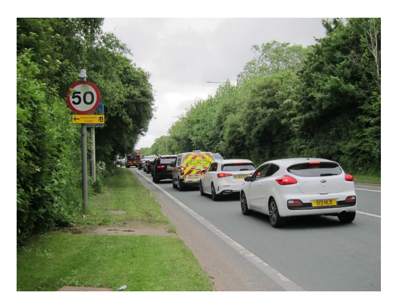
Photo 12: PM, Brook Lane (G S U Landscapes), looking North up A582 Penwortham Way towards Chain House Lane.