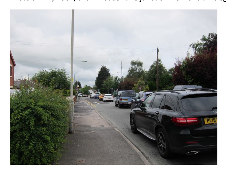
Photo 10: PM, Chain House Lane view towards A582 Junction from the East.